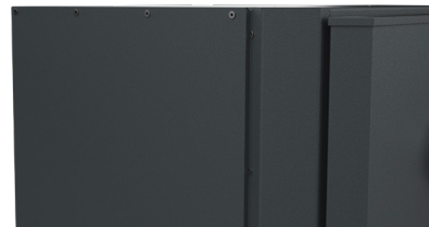
SPECIAL RIVETED FINISH (RUSTPROOF GALVANISED STEEL)